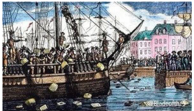
The 1773 Boston Tea Party was staged because the colonies did not wish to pay tariffs on Tea.

The first comes from our Colonial American Revolutionary History. On December 16 th , 1773 it seems that a certain Masonic Lodge contributed to a ‘Tea Party’. This was in reaction to tariffs on tea imposed by our mother country, Great Britain. This and other taxes sprouted the idea of ‘No Taxation without Representation’. From this beginning we built a nation ‘of the people, by the people and for the people’ according to President Lincoln in his famous November 19 th , 1863 Gettysburg Address.