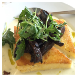
Tortine di Polenta con Funghi

Mixed baby greens, tomato, olive; dressed with house made vinaigrette.