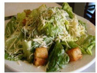
Insalata della Casa

Grilled 14oz Carlton Farms pork chop, parmesan whipped potatoes, sautéed vegetables, citrus Dijon butter and apricot mostarda.