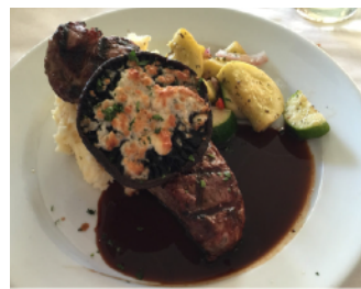
Bistecca al Porto